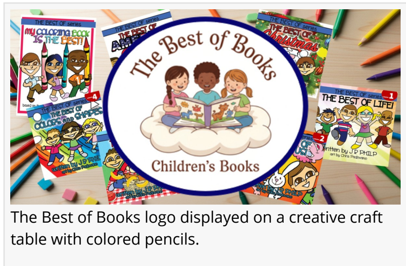
The Best of Books logo displayed on a creative craft table with colored pencils.