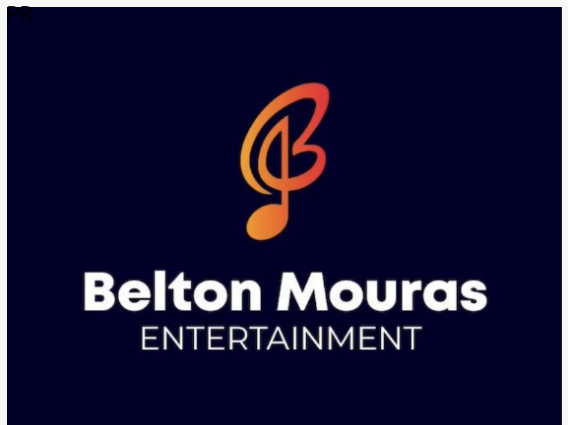
Belton Mouras Entertainment

This press release can be viewed online at: https://www.einpresswire.com/article/872954958