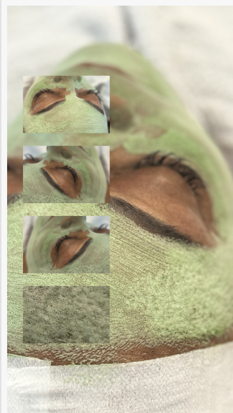
Customized clinical treatments focus on barrier restoration and deep exfoliation.

"We don't just rely on hands," notes Yesinovskiy. "We use physics and technology to wake up the skin cells."