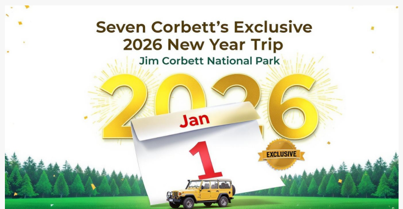
New Year Celebration