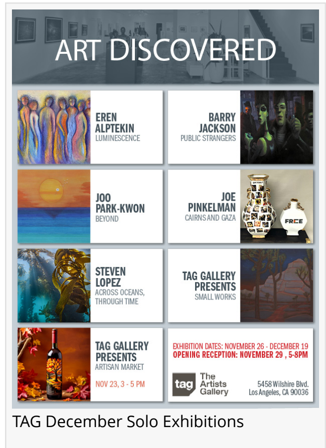
TAG December Solo Exhibitions