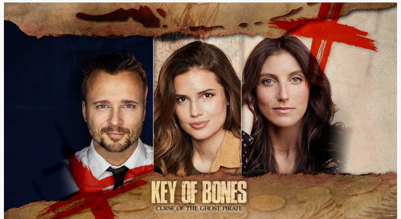
Key of Bones: Curse of the Ghost Pirate

A supernatural horror-comedy, Key of Bones blends pirate mythology, ghost-story thrills, and the eccentric island energy that makes the Keys world-