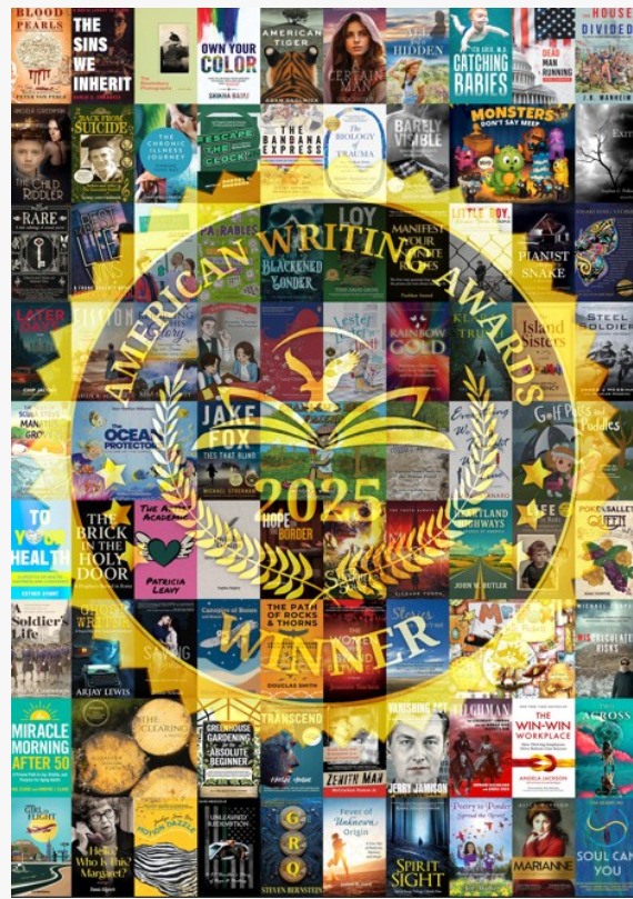
2025 America Writing Awards Winners

NOW OPEN FOR SUBMISSIONS: 2026 CONTEST ENTRY DEADLINES