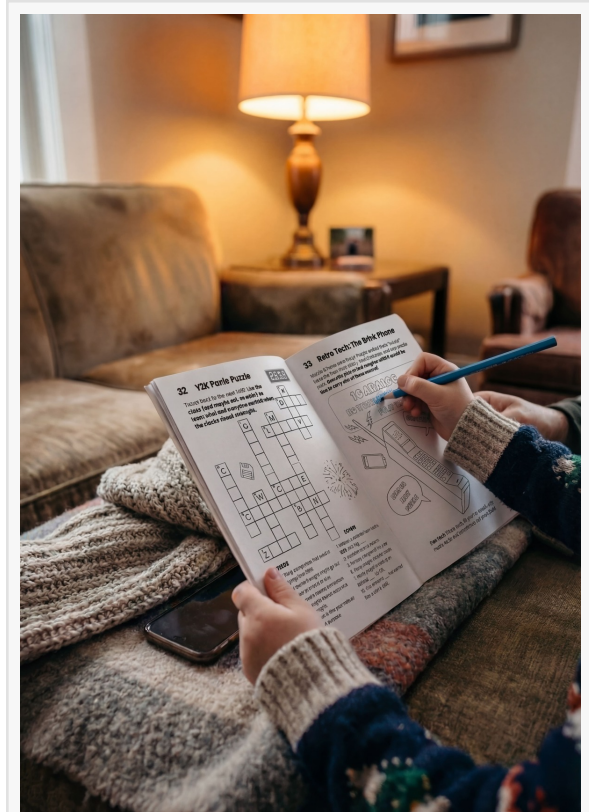
Screen free winter break downtime with a 90s themed puzzle book.

The activity book features puzzles and trivia tied to the decade, including crosswords, word searches, mazes, logic challenges, and brain teasers. Themes range from 90s technology and games to school life and pop culture, offering material that connects 90s themes with present day play.