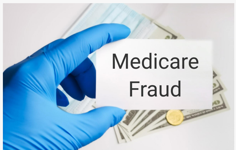
What Data Says About Health Care Fraud

Helping build clearer, evidence-based counter-narratives for defense strategy.