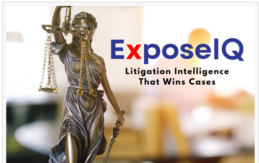
ExposelQ Litigation Intelligence That Wins Cases

Components of the Updated Medicare Fraud Defense Suite include: