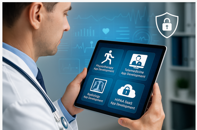
Physiotherapy App Development firm in US

For enterprise digital health products, payers, labs, and care networks, Taction delivers HIPAA-compliant SaaS platforms with audit logging, encryption, PHI governance, multi-tenancy, role-