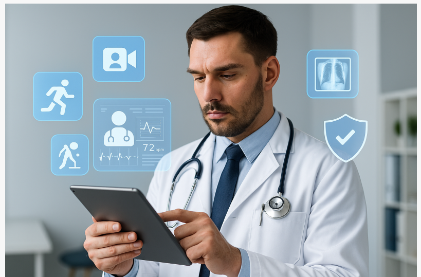
Radiology App Development Services

SACRAMENTO, CA, UNITED STATES, December 9, 2025 /EINPresswire.com/ -- Taction Software, a U.S.-based leader in custom healthcare IT solutions, today announced a major expansion of its HIPAA-compliant application development capabilities. The company is strengthening its services across Physiotherapy App Development, Telemedicine App Development, Radiology App Development, and HIPAA SaaS App Development, addressing the growing nationwide demand for secure and scalable digital health platforms.