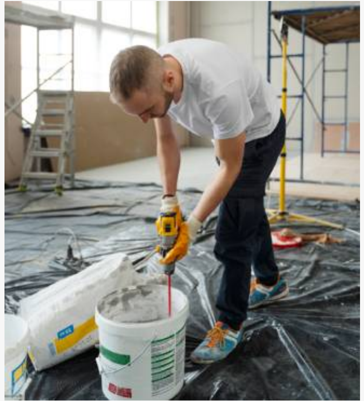
Colorado Field Services-