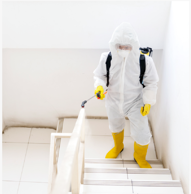
Affordable mold remediation services