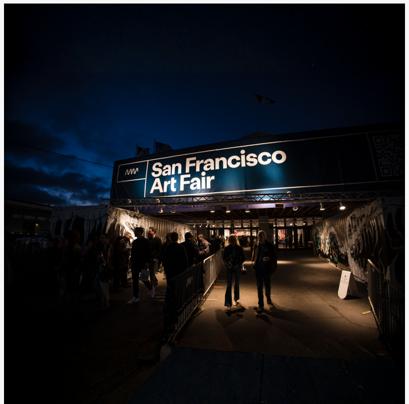
Visitors gather at the illuminated entrance of the San Francisco Art Fair, setting the stage for an evening of contemporary art and cultural exchange.

About TERAVARNA: From its home in Los Angeles, TERAVARNA connects artists worldwide through themed art competitions, online juried shows and physical art fairs, Solo Exhibitions ,