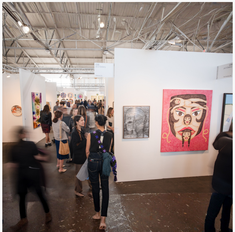
Visitors explore gallery booths at the San Francisco Art Fair, engaging with contemporary artworks in a vibrant and dynamic exhibition setting.

This press release can be viewed online at: https://www.einpresswire.com/article/873560432