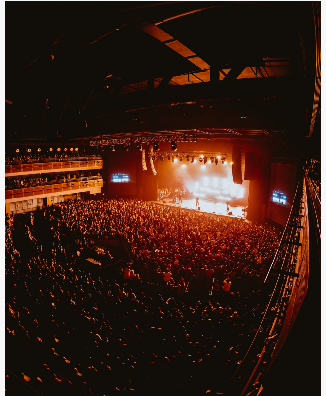
The Theater at Virgin Hotels - Record-breaking attendance for Maoli Music supported by Smartstage rental solutions