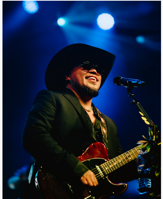
Maoli Music sets the tone in Las Vegas at The Theater, Virgin Hotels atop Smartstage rental staging

https://www.smartstage.com/maoli-music-makes-history-with-smartstage-at-the-theater-virgin