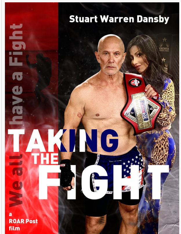
Film poster for Taking The Fight Feature Documentary

he trains, recovers from serious injuries, and pushes beyond physical and emotional limits to pursue a championship title. At its core, the film explores not just combat—but love for the sport, the team that shapes him, and the dream that refuses to die.