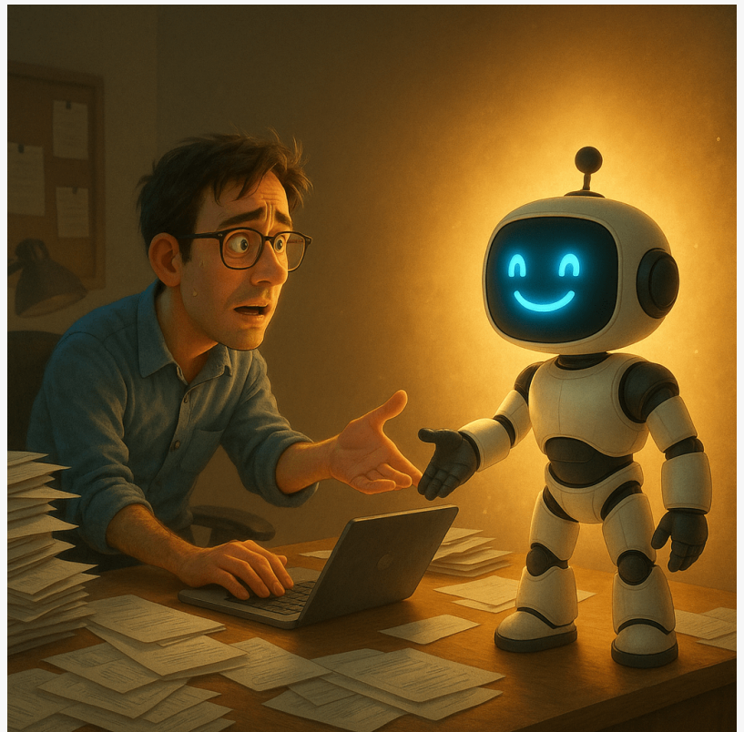
AI automate order entry in ERP system