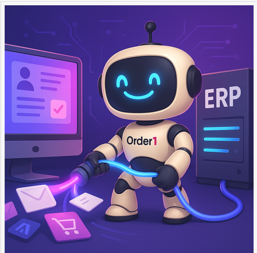
AI for sales administrators connected to ERP system