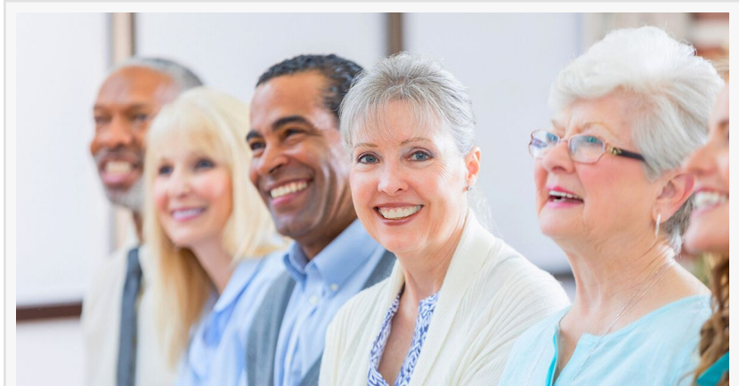
Group of adults participating in an engaging lifelong learning class.

JACKSONVILLE, FL, UNITED STATES, December 9, 2025 /EINPresswire.com/ -- The Osher Lifelong Learning Institute (OLLI) at the University of North Florida (UNF) is expanding opportunities for lifelong learners to connect and grow through Osher Online, a national initiative created by the Osher National Resource Center (NRC) at Northwestern University.