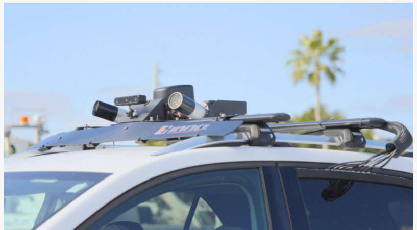
Noteworthy AI's Inspect Edge Camera on Utility Fleet Vehicle Roof