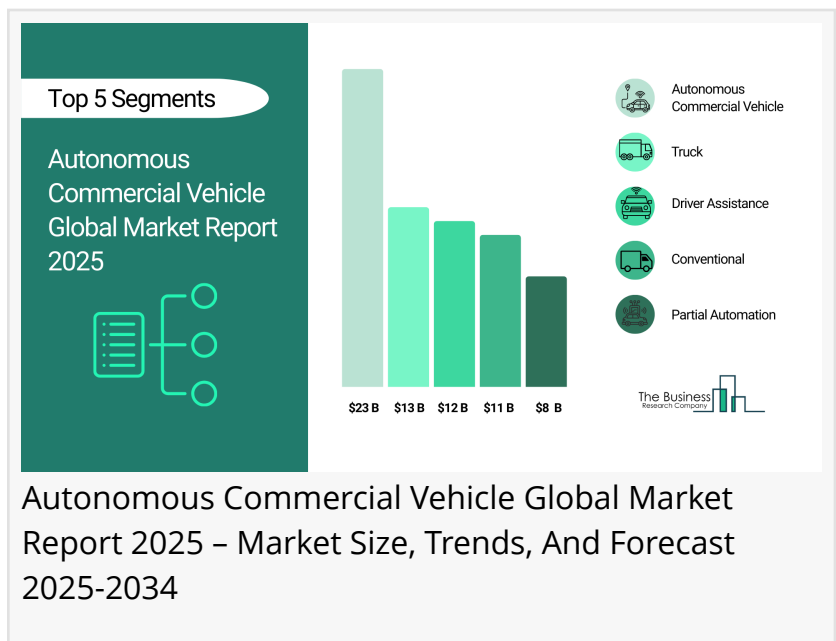
Autonomous Commercial Vehicle Global Market Report 2025 – Market Size, Trends, And Forecast 2025-2034

https://www.thebusinessresearchcompany.com/sample_request?id=3193&type=smp