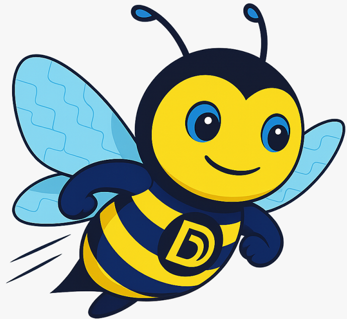
Introducing DBee, the DATABASICS AI Mascot

The introduction of DBee addresses a commonly cited challenge among finance and operations leaders: "Why didn't we catch this sooner?"