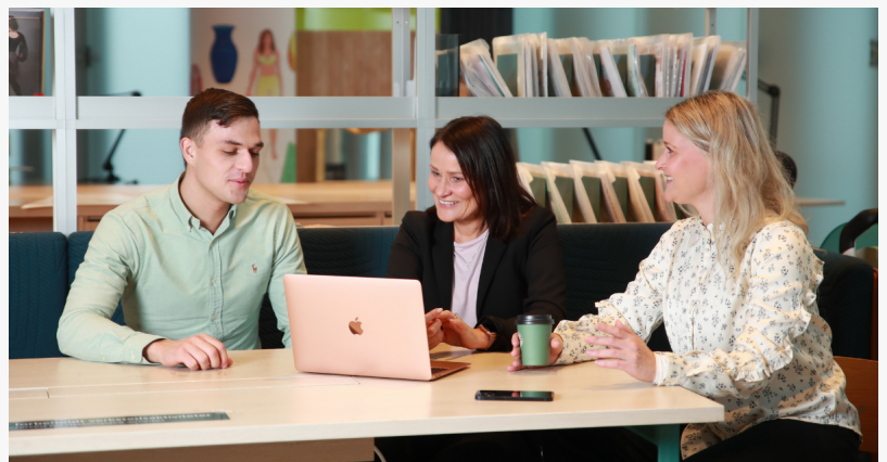
A photo of the Helfi team on their office desk