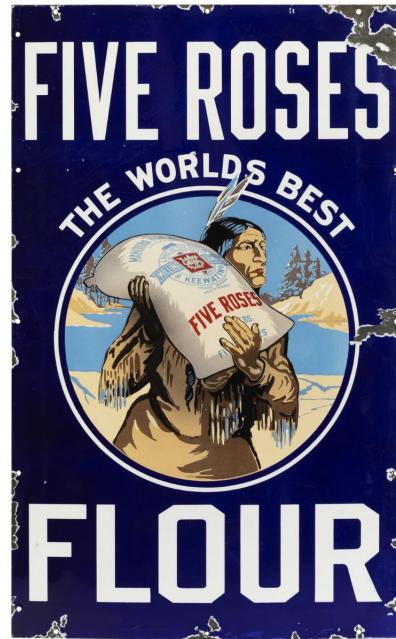
Canadian 1920s single-sided porcelain sign for Five Roses Flour ("The World's Best Flour"), 41 ¾ inches by 26 inches, graded 8.25 for condition, with great color and gloss (CA$24,780).

An American 1940s Kendall Motor Oil framed single-sided tin horizontal sign, measuring 12 inches tall by a stout 72 inches wide, graded 8.75 and in untouched original condition, housed in the original painted frame, changed hands for $6,490. Also, a Canadian 1957 Texaco Sky Chief single-sided porcelain gasoline pump sign ("Supercharged With Petrox"), the small size version,