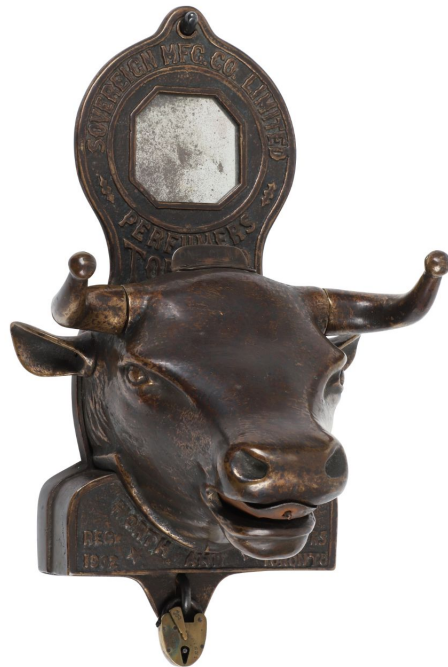
Canadian circa 1902 Worth-Martin coin-op cast iron bull's head perfume dispenser ("Take the Bull by the Horns!"), made in Toronto by Sovereign Mfg. Co. Ltd. (CA$16,520).

All prices in this report are in Canadian dollars and include an 18 percent buyer's premium.