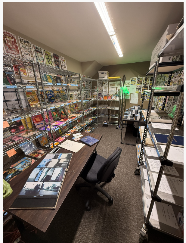
A portion of the largest UFO broadcast library set for auction on December 13th.