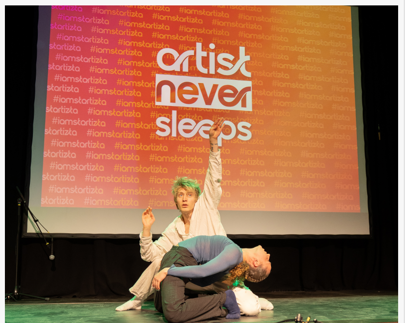
Dancers performing a choreographed routine under stage lighting at the Startizta showcase.

The launch marks a significant step for the global creative community. Startizta’s early users come from different countries and artistic backgrounds, proving that the need for a unified artist hub is universal. The platform is free to join and accessible on web and App Store.