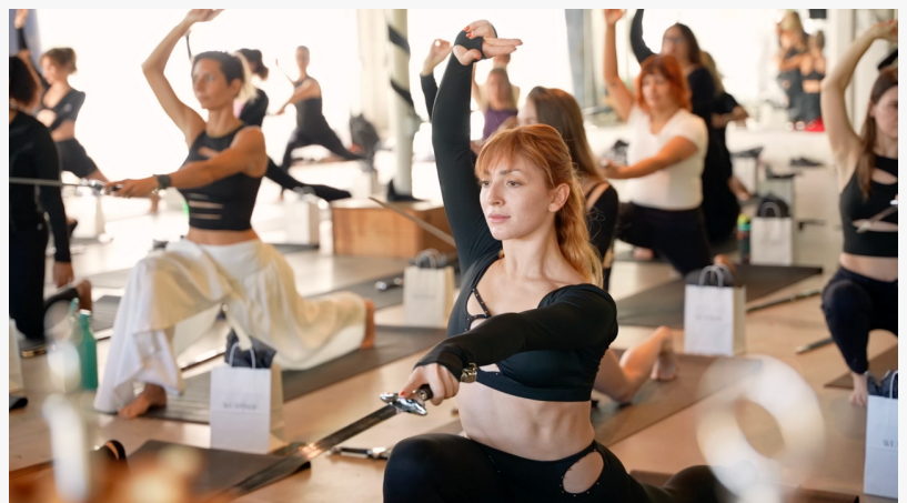
A woman practicing sword yoga at WeaponUP's in person event in Miami