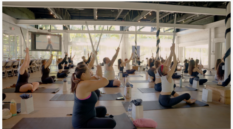
WeaponUP's first in-person event in Miami, FL kicked off the Inspiring Women Fund

"We've always known that WeaponUP is there for the women who show up for themselves —