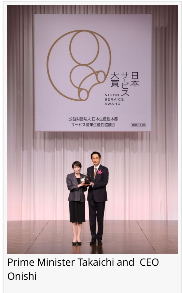
Prime Minister Takaichi and CEO Onishi

3. Co-creation Platform for New Experience Value: By effectively matching inbound visitors with diverse needs to excellent Japanese services, the platform contributes to enhancing the overall travel experience and vitalizing Japan's inbound tourism market.