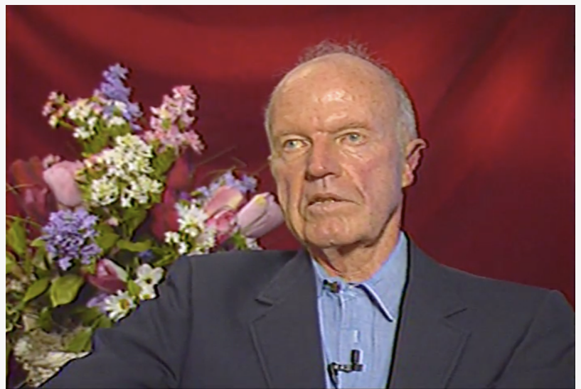
Astronaut Gordon Cooper interview on UFO, Aliens and humans on mars

□ Declassified Government Files: A physical vault containing over 500 declassified documents referencing Project Aquarius, the CIA, and Majestic 12.