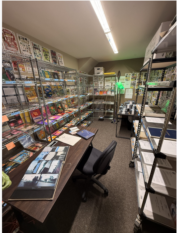
A portion of the largest UFO broadcast library set for auction on December 13th.

Beyond Mars, Cooper alleges a systematic effort by defense agencies to manage