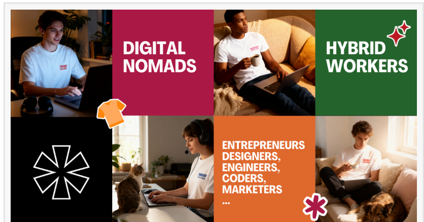
WFH T-shirts - T-shirt Set for Digital Nomads