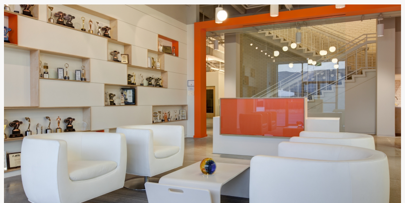
AllenComm Honored as a Top 2026 eLearning Content Developer for Transforming Corporate Training

EINPresswire.com/ -- AllenComm has been named one of the Top eLearning Content Development Companies for 2026, delivering innovative and scalable corporate trainings that drive measurable business results.