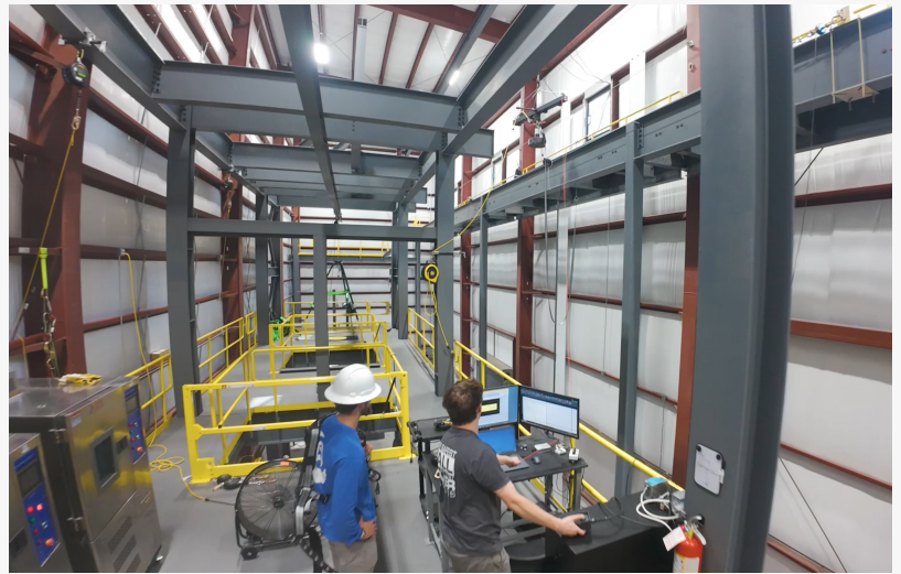
Gene Verble Testing & Training Facility

EINPresswire.com/ -- The first expansion plans were drawn in 2021, ground was broken in 2024 and the Gene Verble Testing & Training Facility was dedicated to the Safewaze founder in February 2025. The 4-story, 4,000 square foot lab is now fully operational, elevating innovation and safety for fall protection equipment everywhere, with three virtual tour options available online.