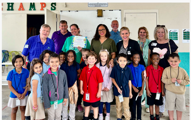
Roots and Wings

Founded in 2016, Roots and Wings has been a champion for literacy in Palm Beach County. The nonprofit focuses on improving every Project UpLift student's literacy skills, so they have the tools needed to succeed. Its mission is to enhance the educational experience and outcomes for students by providing tutoring and mentoring that strengthen reading, writing, and comprehension skills. Roots and Wings operates two key initiatives: Project UpLift, a free, small-group, after-school tutorial program that helps students in grades 1–3 who are reading one or two grade levels below grade level reach proficiency by the end of third grade; and The Above and Beyond Awards, a recognition program honoring outstanding teachers and staff chosen by their peers for exceptional support of students, schools, and the community. Today, the organization collaborates with 20 schools and countless teachers and volunteers, currently