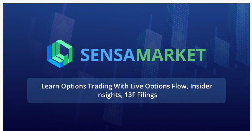
SensaMarket Learn Live Trading