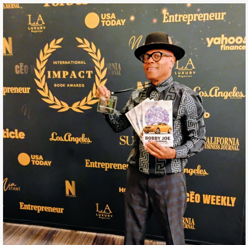
Celebrating International Impact Book Awards recognition for "Bobby Joe the Criminal."

Set in 1990s New York, the story moves through high-pressure FBI operations, the vibrant streets of Brooklyn, and tense confrontations that test loyalty and identity. Alongside the action, the book explores the emotional weight carried by those who wear the badge.