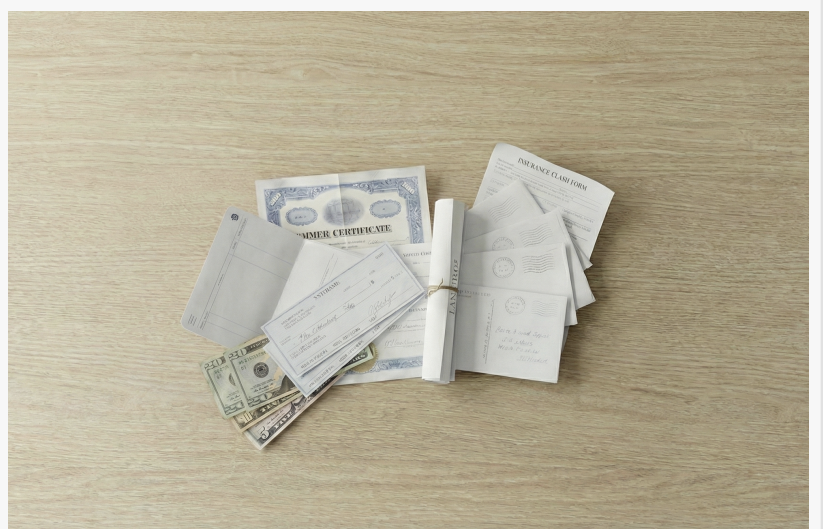
Unclaimed Assets including cash, uncashed checks, insurance payouts and stock sit on a table

For families and individuals, recovering this money can provide meaningful support. Residents often use recovered funds to cover rent, medical bills, education costs, or everyday expenses, particularly toward the end of the year when budgets are tighter.