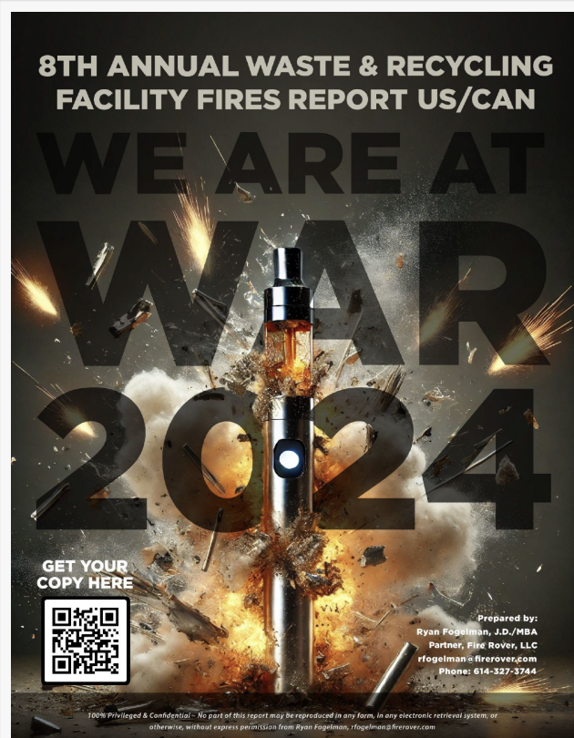
We Are At War! 8th Annual Waste & Recycling Report Cover