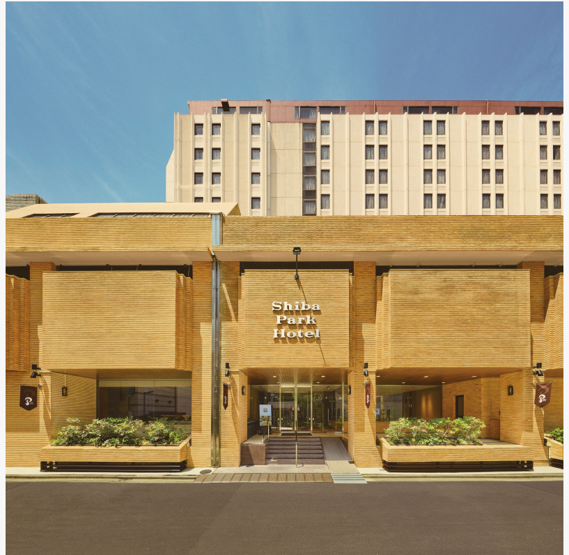
Exterior View of the Shiba Park Hotel

The Book Baton Project proceeds are donated to NPO Room to Read Japan