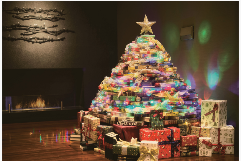
A Book Tree decorated with books donated by guests. Display open until early January.

This year, hotel staff created a "Book Tree" using 665 donated books. Shiba Park Hotel, operating under the "Library Hotel" concept, holds approximately 1,500 books and has participated in this project since 2022, marking its fourth year. In 2025, book donations began in June, and a total of 665 books were collected. Since joining in 2022, approximately 8,300 books have been gathered. The Book Tree, born from the connection between books and the hotel, has a unique and beautiful form.