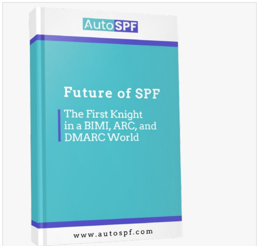
Future of SPF

Brad Slavin DuoCircle LLC +1 855-700-1386 email us here Visit us on social media: