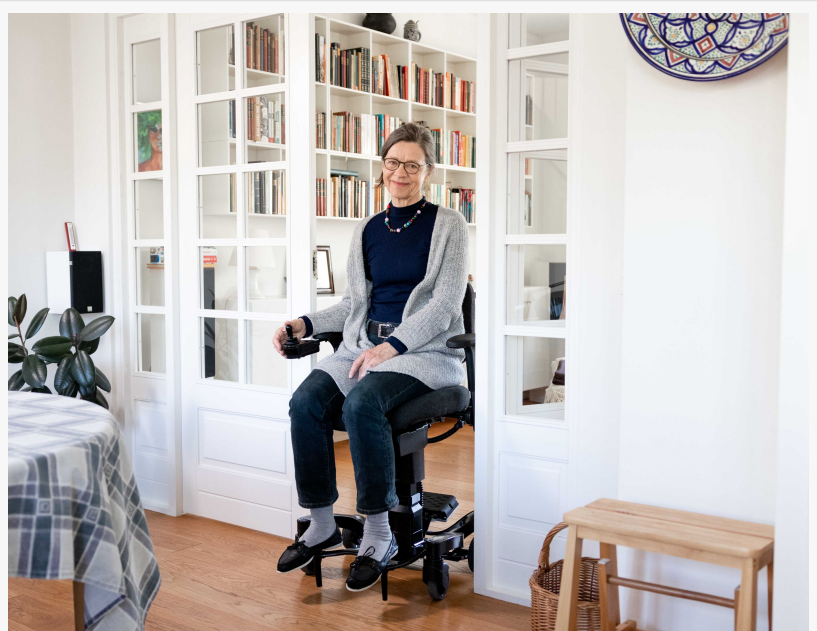
Hybrid mobility chair for independence

Christmas dinners and holiday gatherings often involve extended time at the table, making