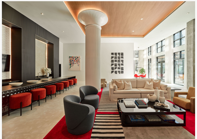
Maizon, Club Lounge