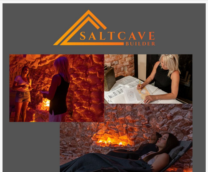
Custom-built salt cave by Salt Cave Inc., combining authentic halotherapy design with expert craftsmanship.