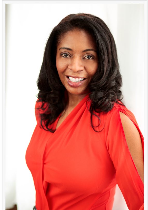
D.A. Murray, Author

Set in a post-apocalyptic world rebuilt after the collapse of the old order, “Dominion: Ascension” flips traditional gender hierarchies and asks an unsettling question: if power changes hands, does corruption disappear, or simply take a new shape? Murray’s answer is uncompromising. Through razor-sharp worldbuilding and deeply human relationships, the novel explores how absolute authority, no matter who wields it, reshapes morality, autonomy, and identity.