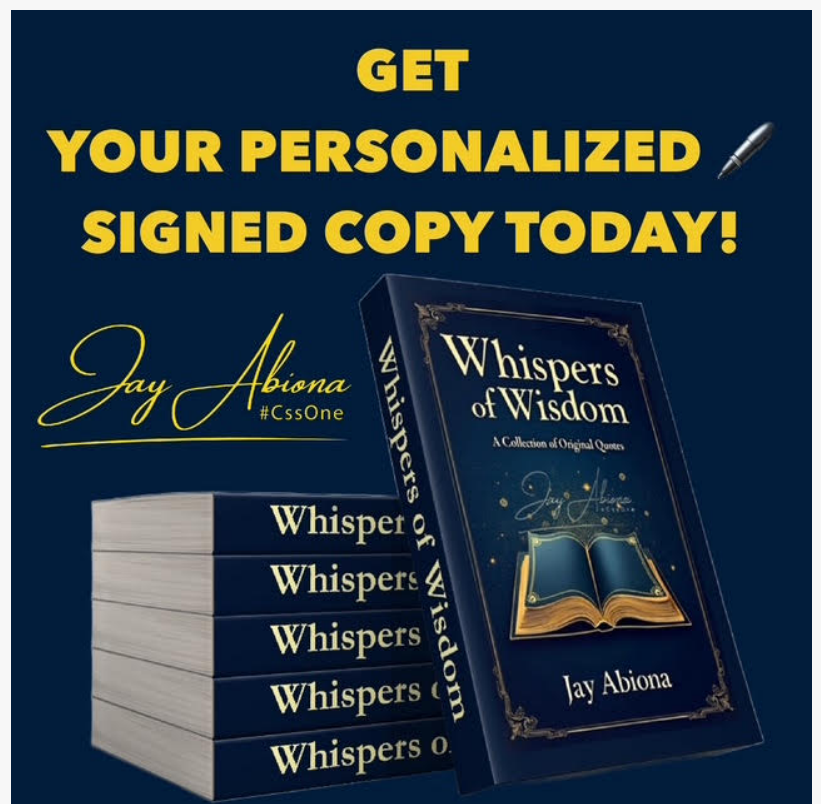
Get your personalized/signed copy of "Whispers of Wisdom" today!