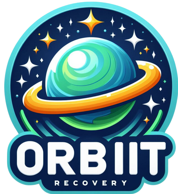
Orbiit Recovery Platform

At the heart of the Orbiit Recovery Ecosystem is intelligent technology designed to adapt to each person within the ecosystem. The platform observes engagement patterns, responsiveness, and participation rhythms—allowing support to evolve naturally as recovery stabilizes or becomes