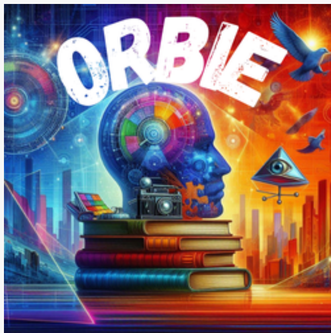
Orbie, Your Virtual Peer Recovery Coach