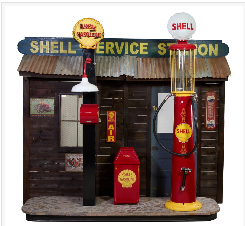
Life size Shell Oil filling station diorama, by McLaren Classic Restorations, in the late-1920s/'30s style, featuring a period Wayne 615 visible gas pump. Estimate: $5,000-$10,000.