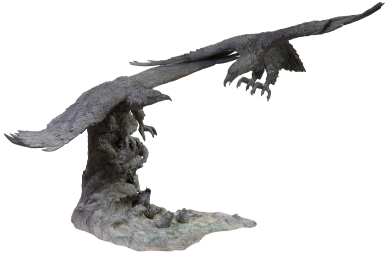
This impressive bronze fountain in the form of two eagles in flight sparring over fish, over a seafoam base, overall 82 inches tall by 108 inches wide, should realize $3,000-$6,000.

The Pop Culture items will be highlighted by a Beatles autographed Crescent electric guitar and memorabilia, the guitar laser signed (estimate: $2,000-$4,000); an early 21st century Rock-Ola jukebox that plays CDs (estimate: $2,000-$4,000); and a circa 1989 Earthshaker! pinball machine, designed by Pat Lawlor, artwork by Tim Elliot (estimate: $1,000-$2,000).