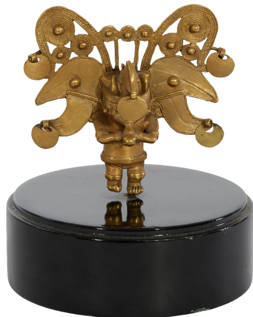
This pre-Colombian Tairona Tumbaga gold pendant carries a pre-sale estimate of $2,000-$4,000.