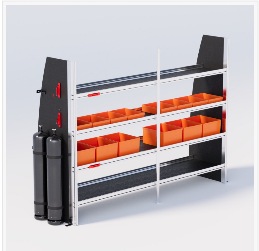
Cargo Van Shelving system by IconicVan

The IconicVan Cargo Van Shelving System is engineered as a stand-alone solution for technicians and fleet operators who require adaptable