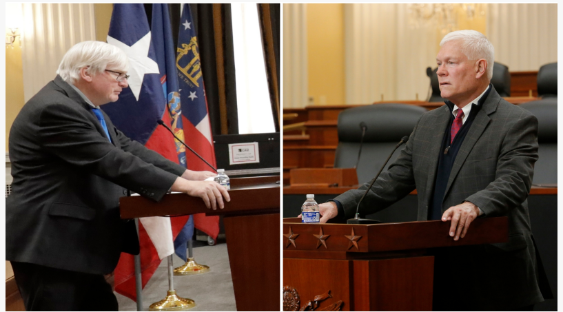
Representatives GLENN GROTHMAN (R-WI), left, and PETE SESSIONS (R-TX) addressing House briefing on Iran on 16 December 2025