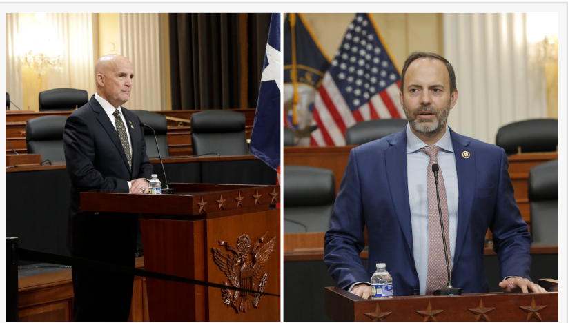
Representatives KEITH SELF (R-TX), left, and LANCE GOODEN (R-TX) addressing House briefing on Iran on 16 December 2025

Addressing the path forward, Mrs. Rajavi was unequivocal. “This regime must be overthrown,” she said. At the same time, she made clear that regime change is not a foreign project: “Regime change is only the duty of the Iranian people and no one else. We have never asked any country to intervene... and we will never do so.”