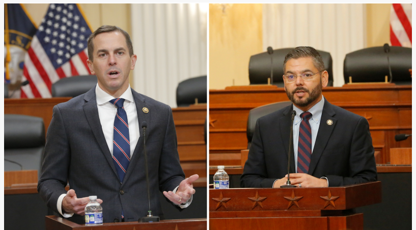
Representatives ROBERT MENENDEZ (D-NJ), left, and RAUL RUIZ (D-CA) addressing House briefing on Iran on 16 December 2025