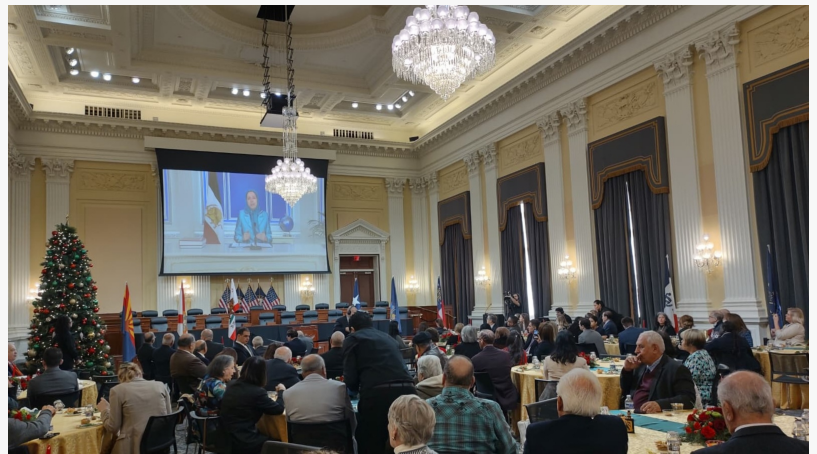
Mrs. Maryam Rajavi, the president-elect of the NCRI addressing House briefing on Iran on 16 December 2025

EINPresswire.com/ -- Members of the U.S. House of Representatives from both parties, congressional staff, and representatives of Iranian American communities from across the country convened on December 16, 2025, in the historic Cannon Caucus Room for a House briefing entitled "Supporting the Iranian People's Struggle for a Democratic Free Republic."