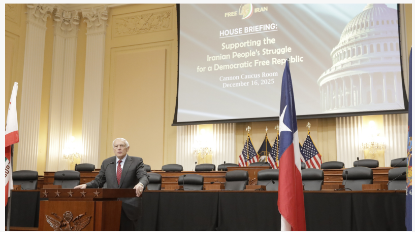
GENERAL WESLEY CLARK, USA (Ret.), 12th Supreme Allied Commander Europe addressing House briefing on Iran on 16 December 2025

While acknowledging that the regime is weaker than at any point in decades, Mrs. Rajavi cautioned that it has not abandoned repression or terrorism. "Brutal suppression at home and the export of terrorism...are the pillars of