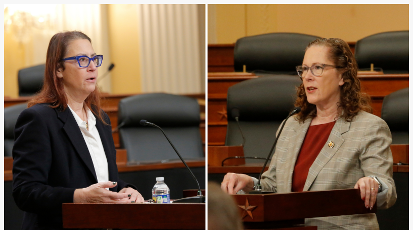
Representatives LAURA FRIEDMAN (D-CA), left, and VAL HOYLE (D-OR) addressing House briefing on Iran on 16 December 2025