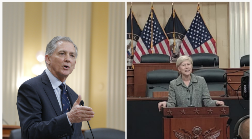
Representatives FRENCH HILL (R-AR), left, and DEBORAH ROSS (D-NC) addressing House briefing on Iran on 16 December 2025