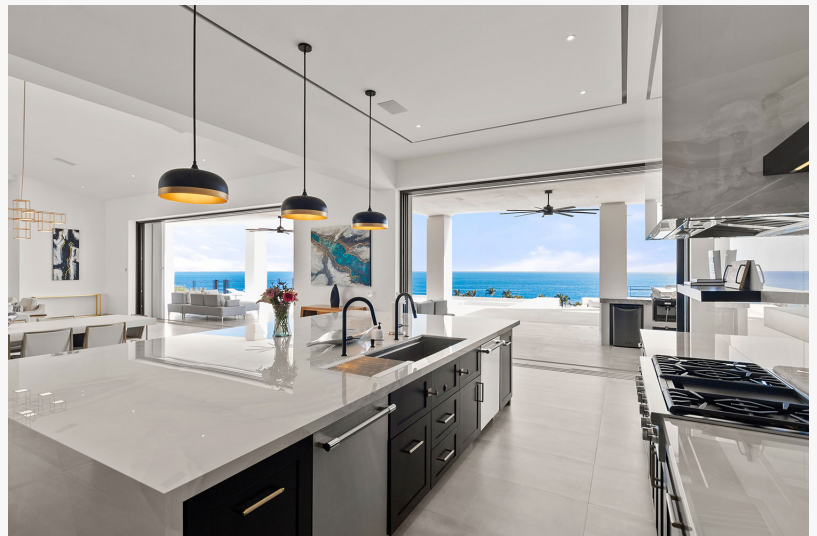
Poco Paraíso in Puerto Los Cabos