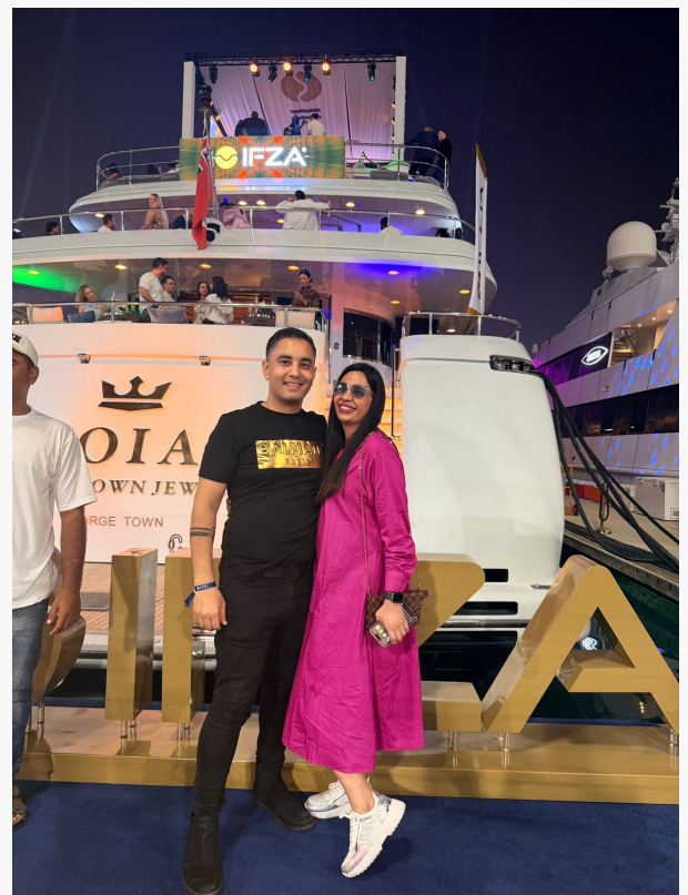
StartAnyBusiness.ae and International Free Zone Authority | IFZA

This partnership highlights Start Any Business's commitment to supporting founders worldwide. The company offers trusted guidance and compliant business setup solutions to help entrepreneurs build their business empires in Dubai.