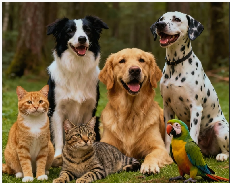
Love and companionship should never be limited by time.