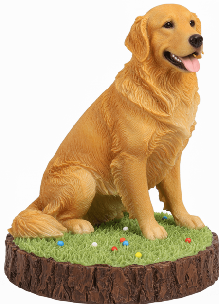
Personalized Pet Resin Figurine – Your Pet's Essence Captured