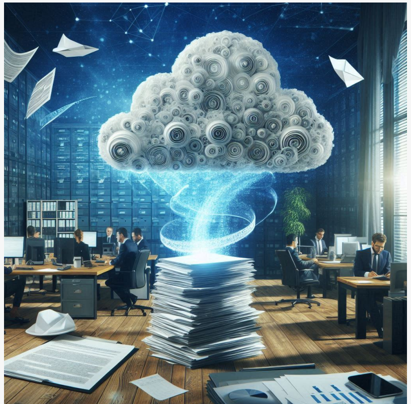
Move information to Cloud and AI to reach high ROI

NEW YORK, NY, UNITED STATES, January 2, 2026 /EINPresswire.com/ -- Celiveo, a global leader in high-security cloud print and document management solutions, today announced a major update to Celiveo 365 Enterprise Edition: the addition of enterprise-class AI-powered document management. This integration creates a dynamic, shared corporate knowledge base from documents captured by teams, supports natural-language queries in Microsoft Teams, and enhances the platform's zero-trust cloud print features—delivering significant productivity improvements, cost savings, enhanced security, and potential ROI of up to 1000%.