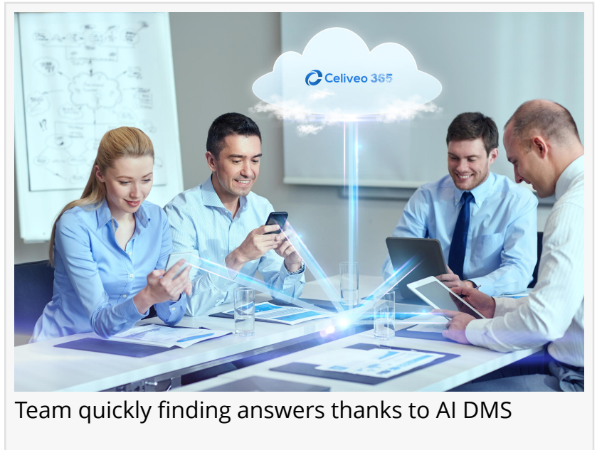
Team quickly finding answers thanks to AI DMS

This press release can be viewed online at: https://www.einpresswire.com/article/876560320