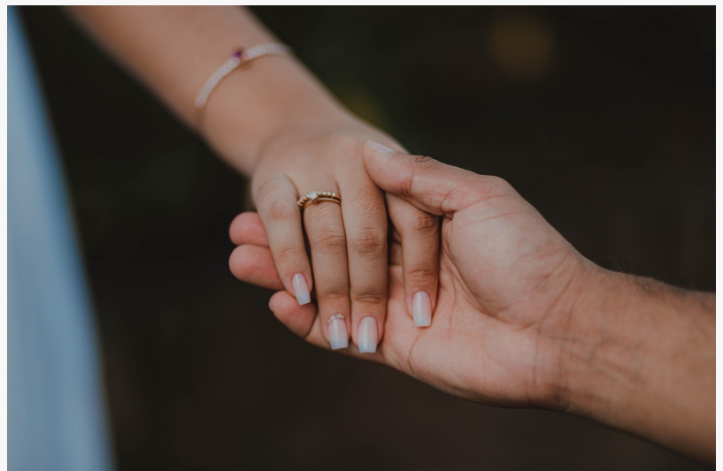
Victim-centred justice focuses on restoration and healing, not just processing cases through systems

This press release can be viewed online at: https://www.einpresswire.com/article/876591757