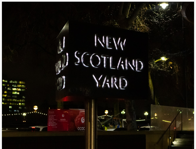
Scotland Yard, where Chukwudum Ikeazor developed expertise in victim-centered justice over 30 years